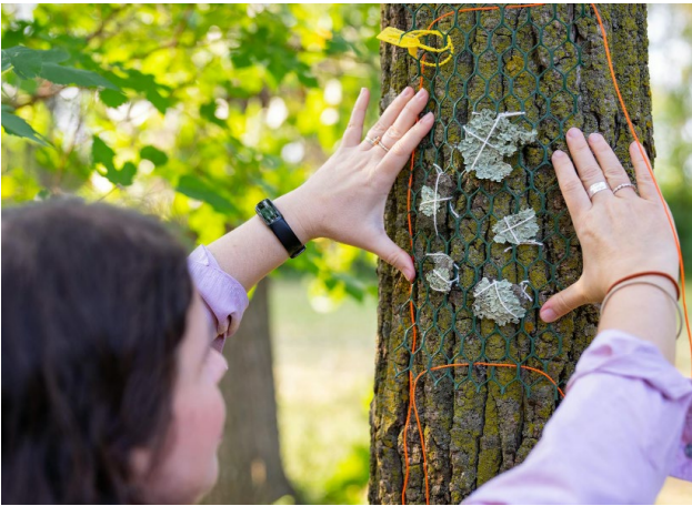
Lichen Transplants