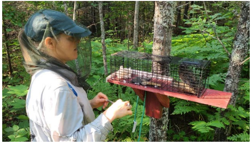
Flying Squirrel Population Monitoring