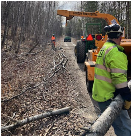
DWP Brush Clearing