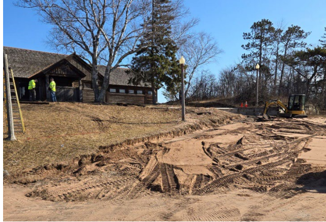
Park Point Beach House Ramp Replacement