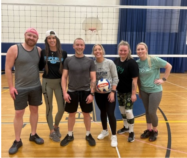
Getting Diggy With It

The winter session of Parks and Recreation's Adult Volleyball League finished on March 17. Ten teams competed in the seven week regular season, held Sunday nights at the Washington Center Gym, followed by a one week playoff. This session's winning teams were Getting Diggy With It for division 1, and Spikological Warfare for division 2.