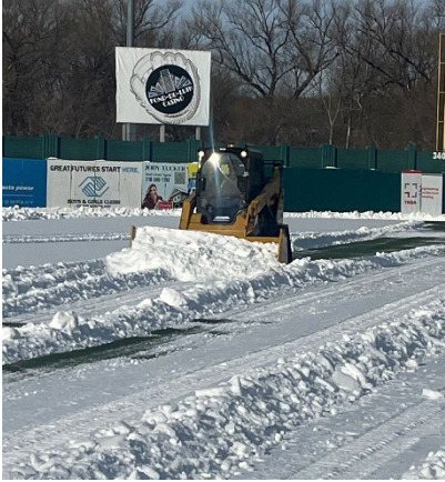
Wade Snow Removal