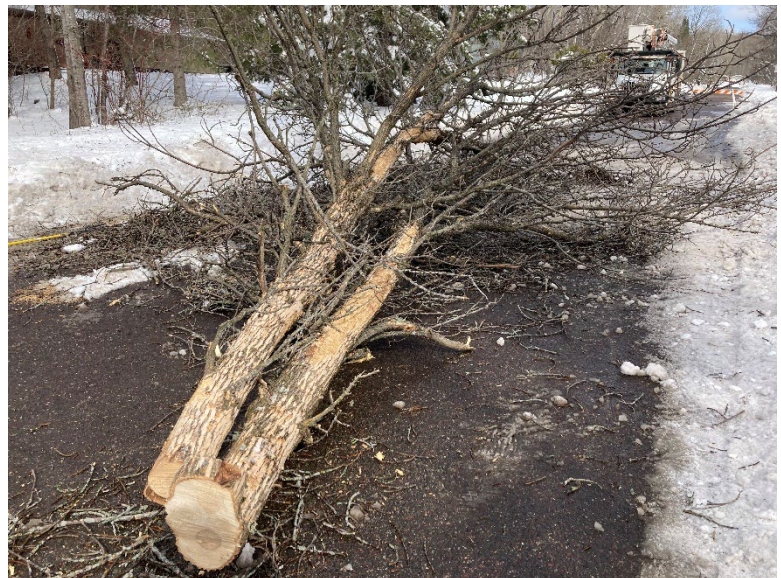
EAB Damaged Tree Removals