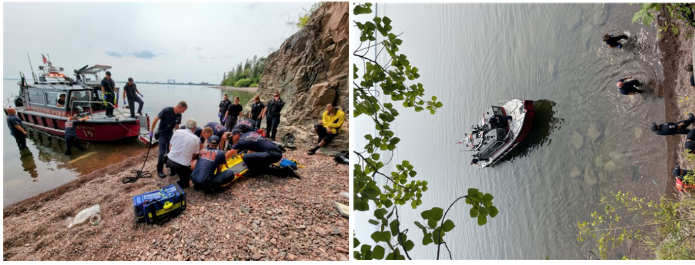
Emergency Crews Packaging the Patient

Crews from Downtown, Lakeside and Lincoln Park responded to the incident along with Mayo Clinic Ambulance Service and the Duluth Police Department.