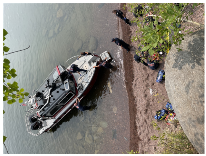
Marine 19 Arriving on Scene