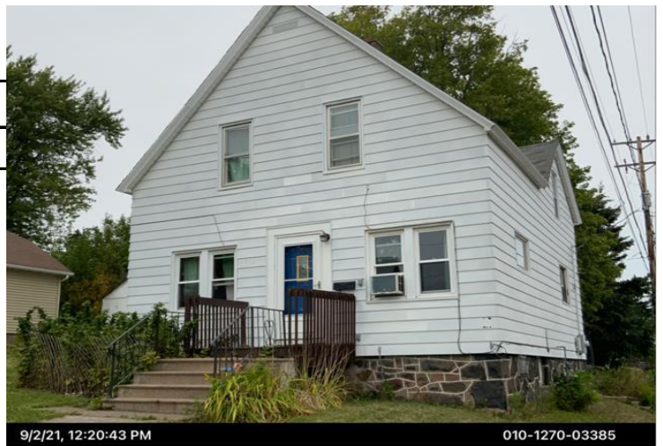
9/2/21, 12:20:43 PM