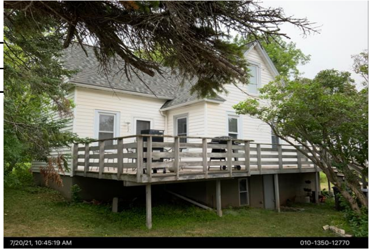
7/20/21, 10:45:19 AM