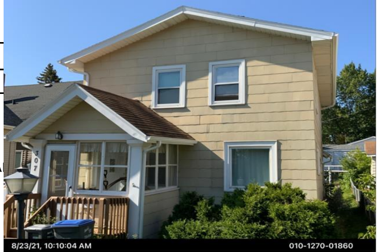
8/23/21, 10:10:04 AM