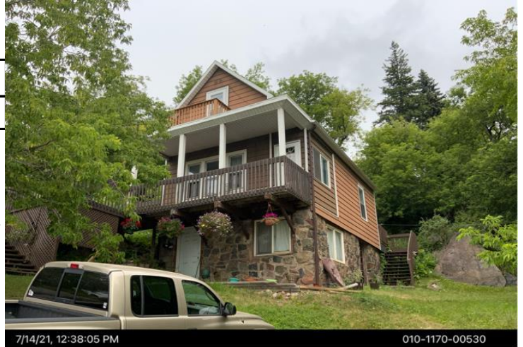
7/14/21, 12:38:05 PM