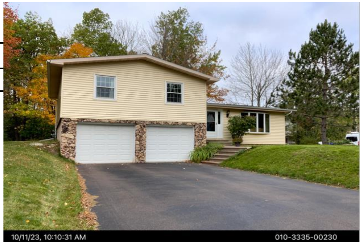
10/11/23, 10:10:31 AM