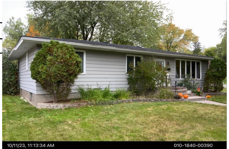
10/11/23, 11:13:34 AM