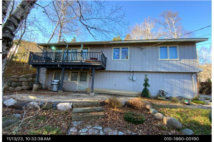
11/13/23, 10:32:38 AM