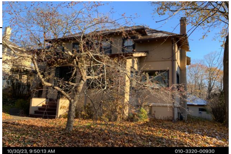
10/30/23, 9:50:13 AM