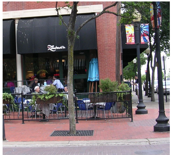
Figure 50-26.4-A: Form district front setback wall height

The maximum height of a fence or wall within required side and rear yard area is eight feet, but the land use supervisor may approve a fence or wall up to 12 feet in height where additional height is to provide adequate security because of topography or the nature of the material or equipment stored in the area. Fences and walls are not permitted in required front yard areas, except for wrought iron fences used to enclose outdoor patio or dining areas, in which case the maximum height of the fence shall be three feet;