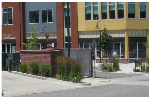
Figure 50-26.3-A: Dumpster screening