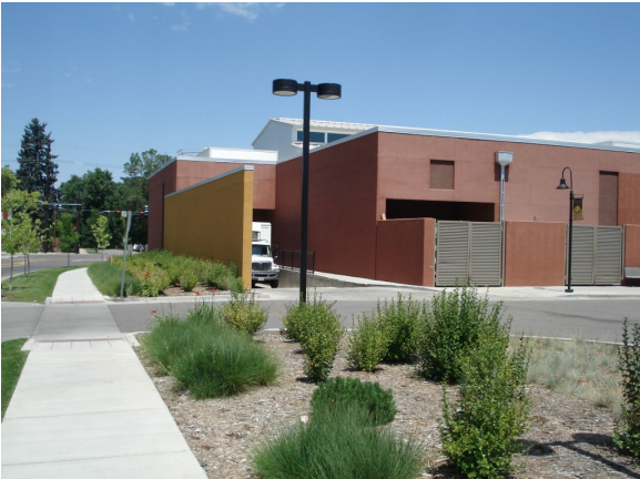
Figure 50-26.2-A: Loading area screening