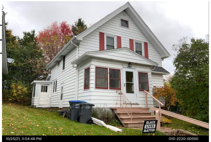
10/25/21, 3:04:48 PM