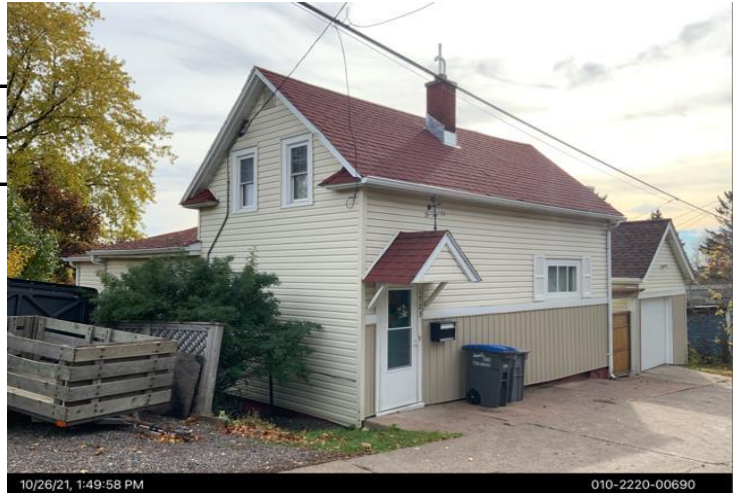
10/26/21, 1:49:58 PM