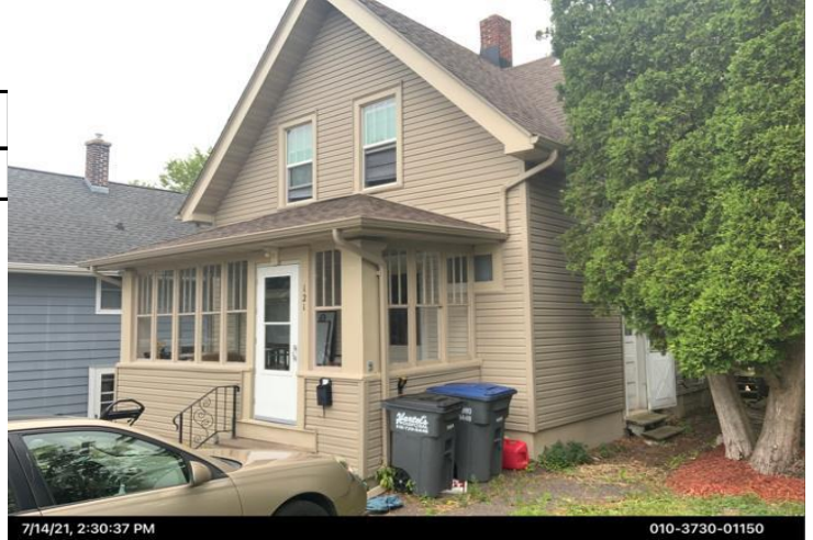
7/14/21, 2:30:37 PM