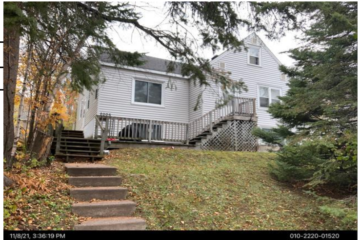
11/8/21, 3:36:19 PM