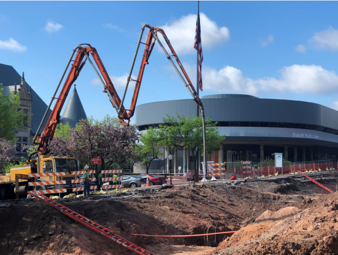
Concrete poured into an old vault in front of the library