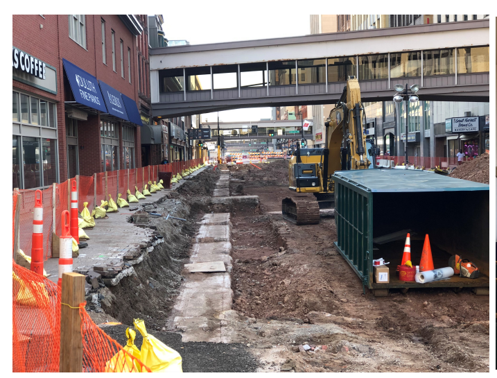
unearthed concrete casing for steam lines