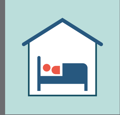
STAY HOME when you are sick