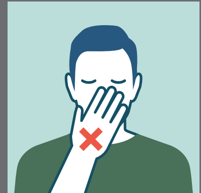
AVOID touching your eyes, nose and mouth