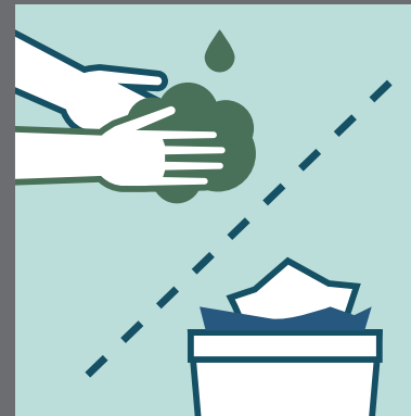
PUT TISSUES IN TRASH BIN and wash hands