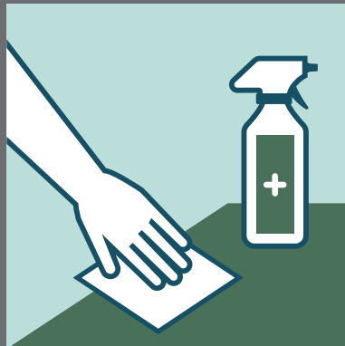
CLEAN and disinfect frequently touched objects and surfaces