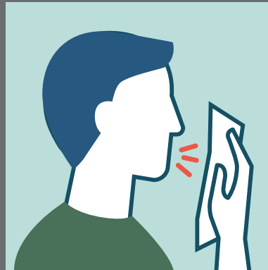
COVER your cough or sneeze with a tissue