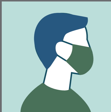
WEAR A FACE MASK