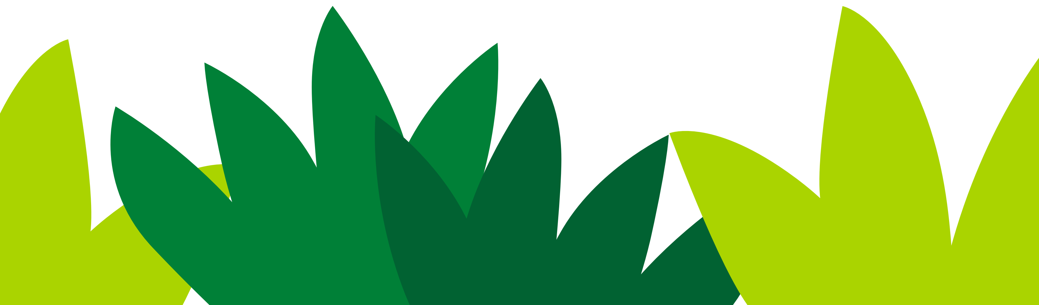
Photo + Final Count

Count the varieties of roses you find in the Rose Garden