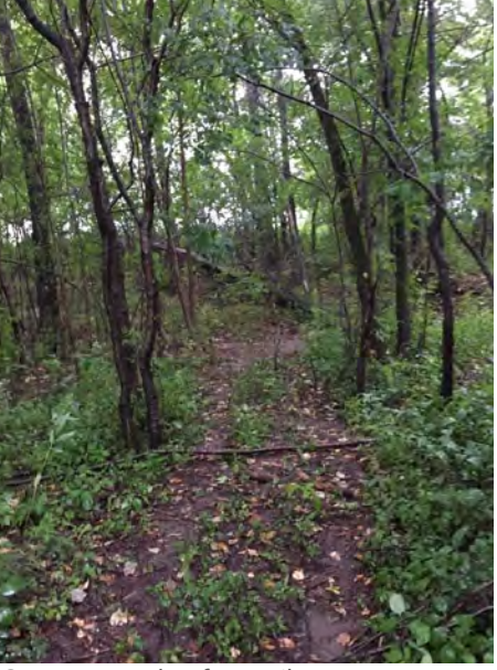
Current natural surface trails