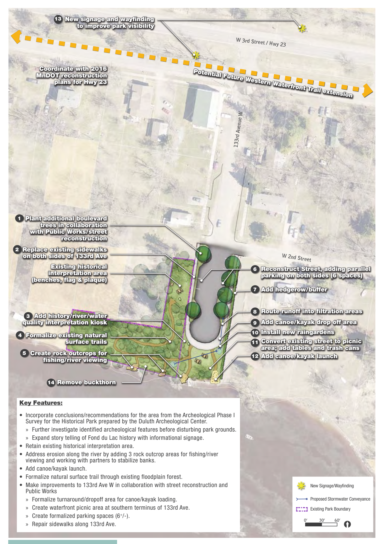
FIGURE 2.1 HISTORICAL PARK MINI-MASTER PLAN