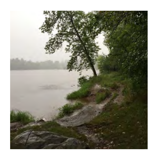
Historical Park provides river access and is a local fishing spot