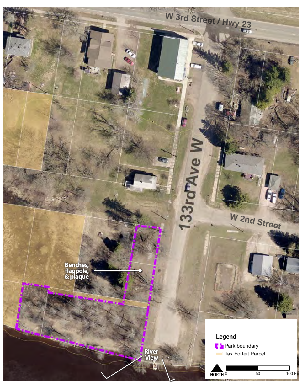
HISTORICAL PARK SITE INVENTORY