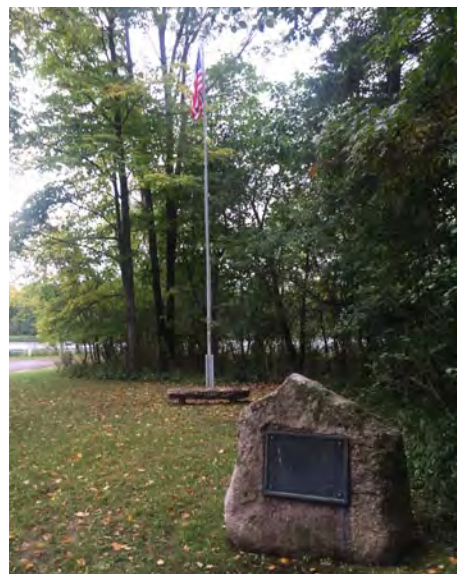
Existing features include benches, a flag, and a historical monument

A desire was expressed by stakeholders to clarify the name and provide identity to the park. The name "Historical Park" is new and unfamiliar to many residents. As part of Minnesota's Clean Water, Land, and Legacy Amendment, there is a potential to write a grant for historical interpretation, art, and wayfinding elements for Historical Park.