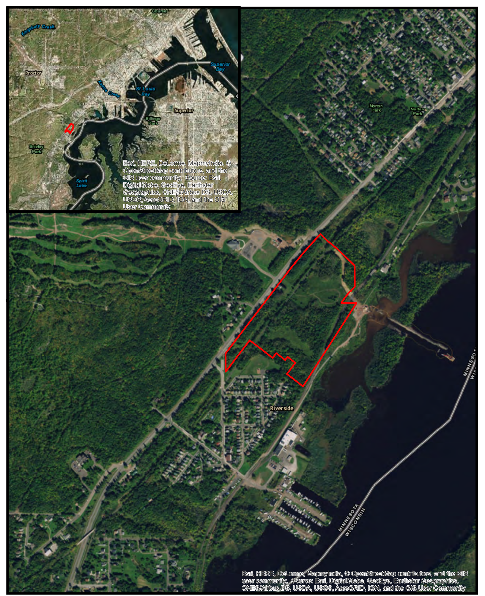
Figure 2: Project Area