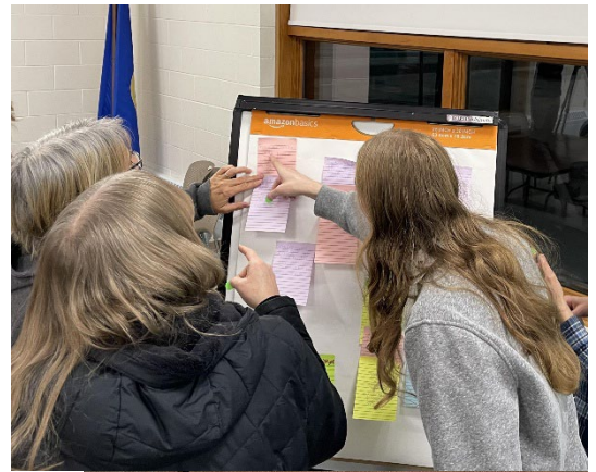
Participants placing dots on top issues from table discussion