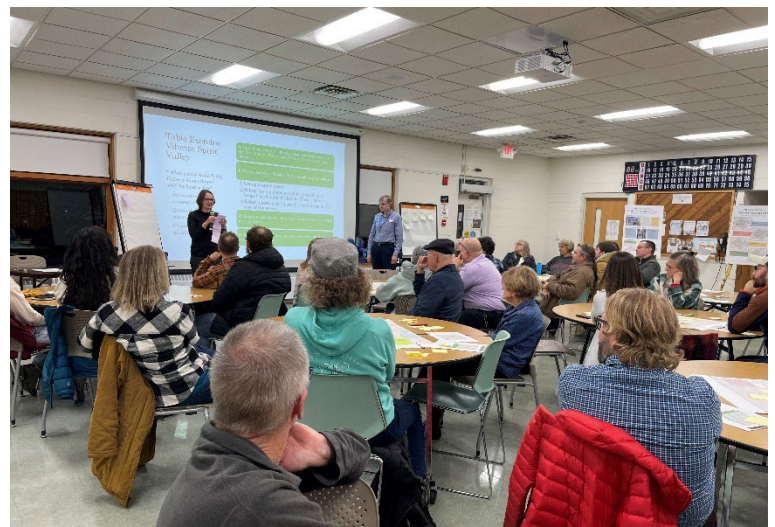
Table captain reporting their table's top issues