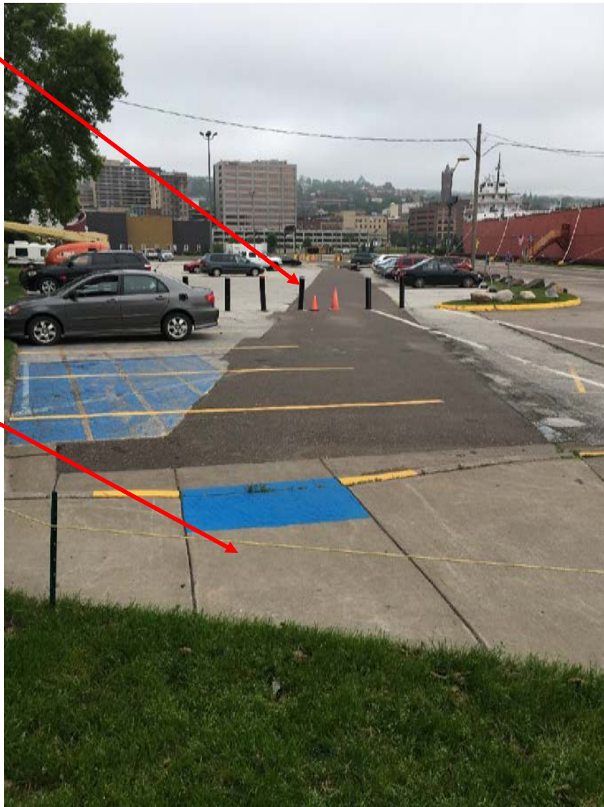
Figure 2- HW alignment facing North