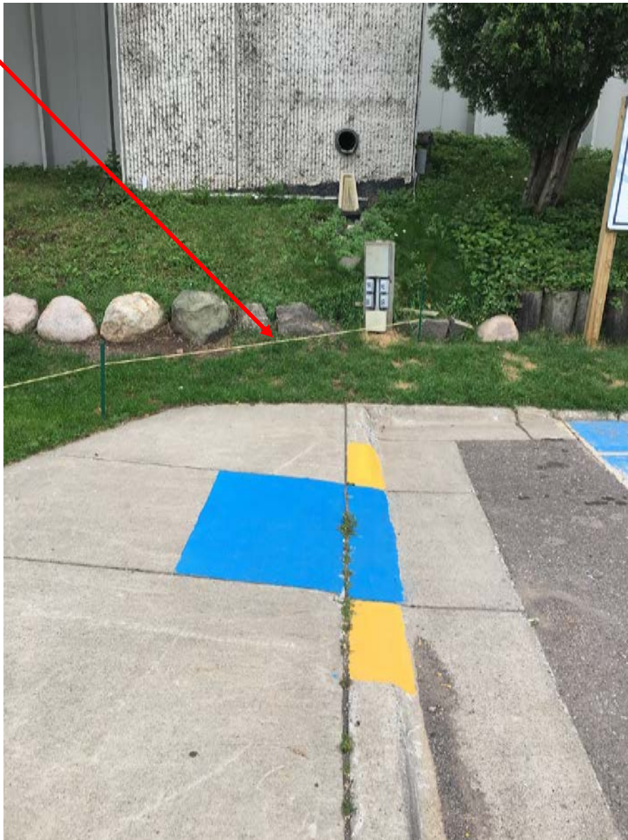
Figure 1- Hot Water entrance into DECC