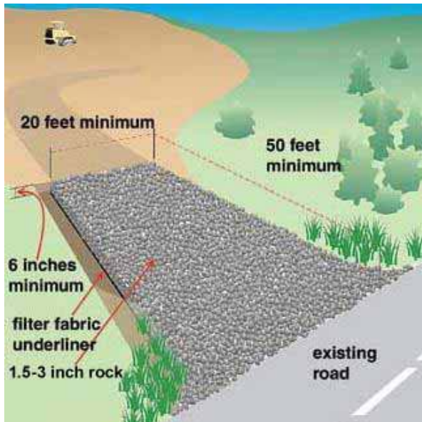
Rock Construction Entrance