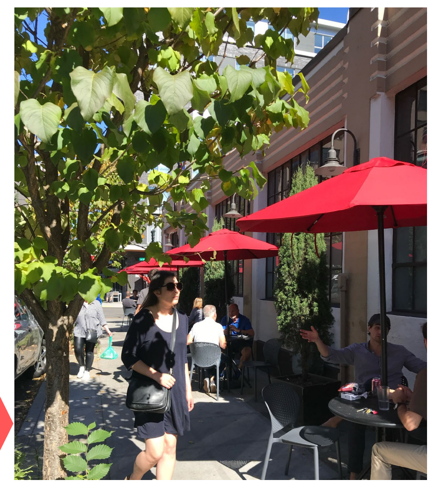
Diners taking a break at a sidewalk café before resuming their stroll to visit more shops

* Successful districts have businesses and landowners working together to create an environment where being in THE DISTRICT IS THE EXPERIENCE causing people to linger longer and return repeatedly bringing more people and spending more money.