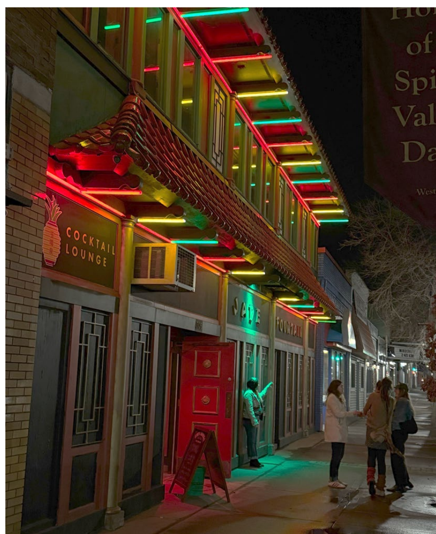
The Jade Fountain's colorful nighttime storefront contributes to making Spirit Valley active 18 hours per day