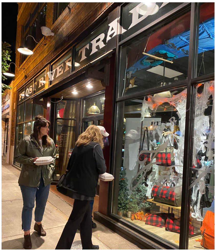
Diners looking at a storefront display after hours and may return when the business is open

Spirit Valley has a good mix of attractions, but gaps in storefronts and times of day with activity limit overall vitality.