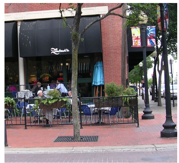
Figure 50-26.4-A: Form district front setback wall height

The maximum height of a fence or wall within required side and rear yard area is eight feet, but the land use supervisor may approve a fence or wall up to 12 feet in height where additional height is to provide adequate security because of topography or the nature of the material or equipment stored in the area. Fences and walls are not permitted in required front yard areas, except for wrought iron fences used to enclose outdoor patio or dining areas, in which case the maximum height of the fence shall be three feet;