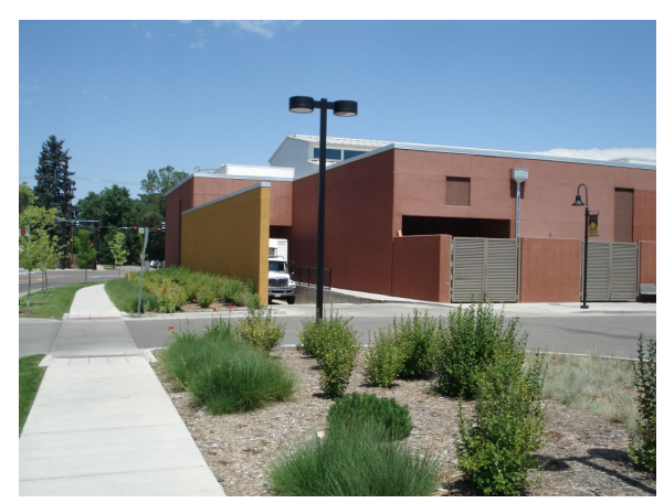
Figure 50-26.2-A: Loading area screening