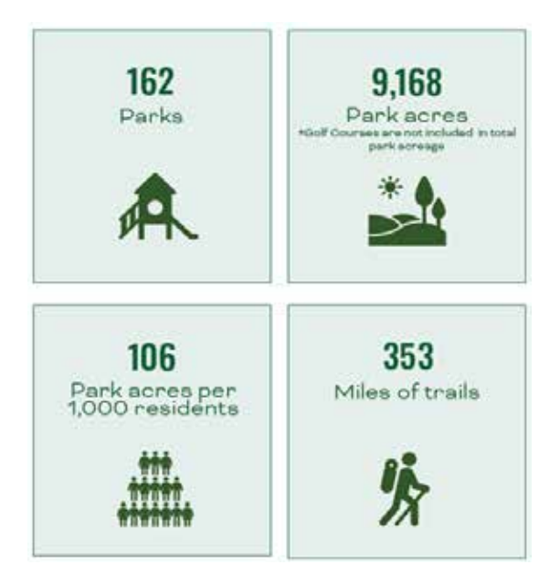
Jessica Peterson Parks and Recreation Manager

Along the great Lake Superior, Duluth's extensive and all-season park system is a critical component of the city's physical, environmental, social, and economic well-being. In addition to a number of destination-quality parks, Duluth's park system offers an array of recreation amenities and a diverse trail network. Duluth's trail system includes 10 miles of horseback trail, 30 miles of paved accessible trail, 16 miles of gravel accessible trail, 38 miles of cross-country ski trail, 85 miles of bike-optimized singletrack trail, and over 150 miles of natural surface hiking trail!