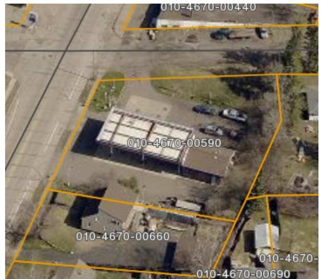
Bird's Eye View of former Gas Station 010-4670-00590

The City of Duluth (the “City”) is seeking proposals from qualified development entities to collaborate in the development of an approximately 0.6-acre parcel located in the Woodland Neighborhood (“Property”) of Duluth. Formerly a fueling station, the site is located at 3942 Woodland Avenue at the southeast corner of East Redwing Street and Woodland Avenue, and within blocks of a local grocery store and many other businesses. A public greenspace and playground is across the road, and baseball fields, hockey arena, local YMCA, Ridgeview Country Club, and a 660 acre park and nature center are less than a mile from the Property. Woodland Avenue features an ADT of approximately 7,000 vehicles per day. More demographic information can be found at https://www.northlandconnection.com .