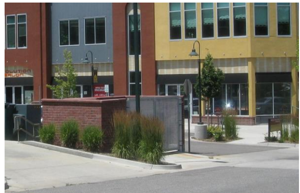
Figure 50-26.3-A: Dumpster screening