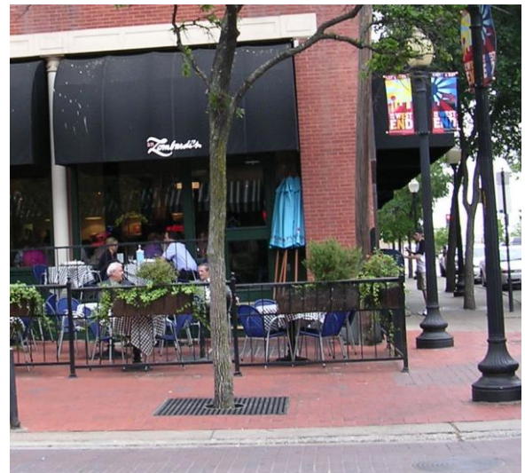
Figure 50-26.4-A: Form district front setback wall height

The maximum height of a fence or wall within required side and rear yard area is eight feet, but the land use supervisor may approve a fence or wall up to 12 feet in height where additional height is to provide adequate security because of topography or the nature of the material or equipment stored in the area. Fences and walls are not permitted in required front yard areas, except for wrought iron fences used to enclose outdoor patio or dining areas, in which case the maximum height of the fence shall be three feet;