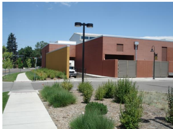
Figure 50-26.2-A: Loading area screening