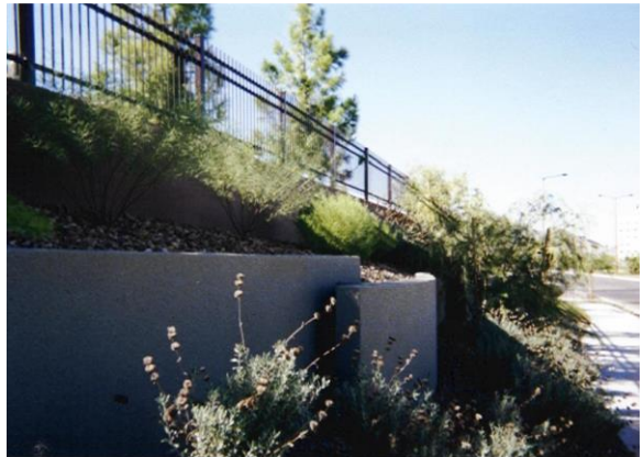
Figure 50-26.4-B: Retaining wall terracing and articulation