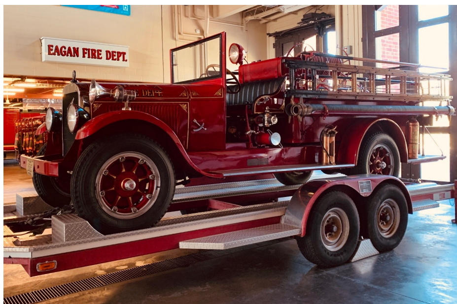
Photo of the truck as it looks today