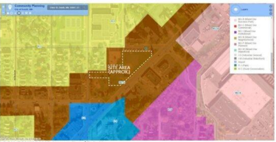
LOCAL ZONING MAP