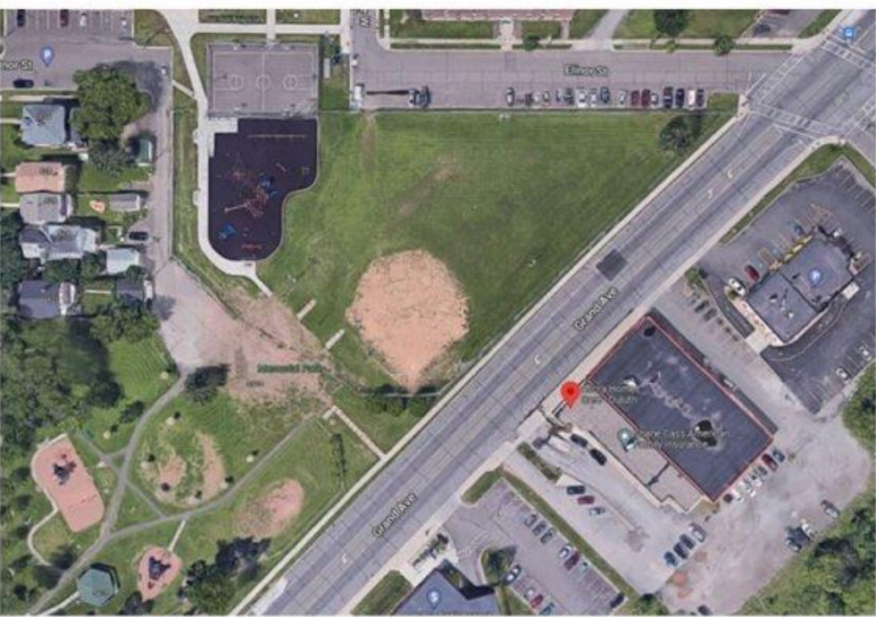
EXISTING SITE PHOTO OF SITE AT MEMORIAL PARK