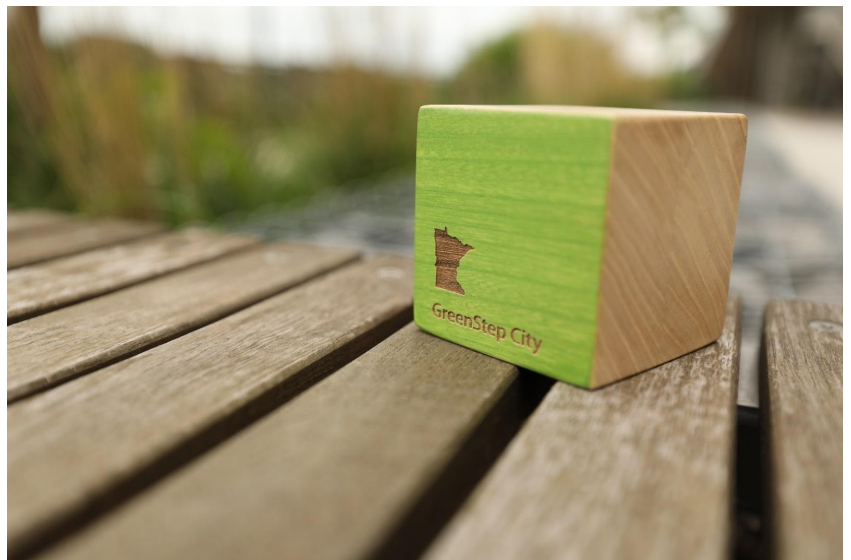
Photo of a Minnesota GreenStep Cities award