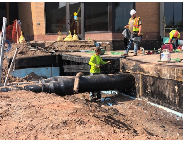
waterproofing the skunnel