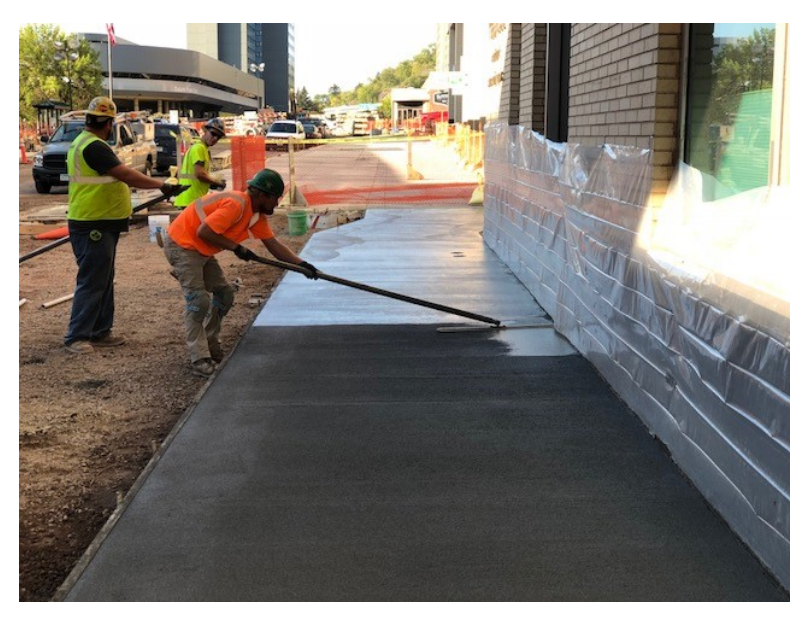
finishing touches on new concrete for sidewalk