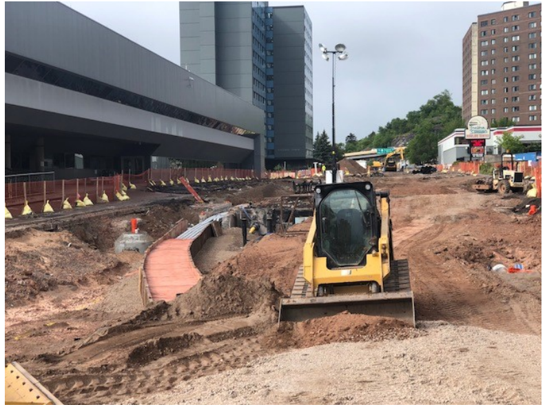
Electrical duct running to the skywalk tunnel between the Radisson and the Library.