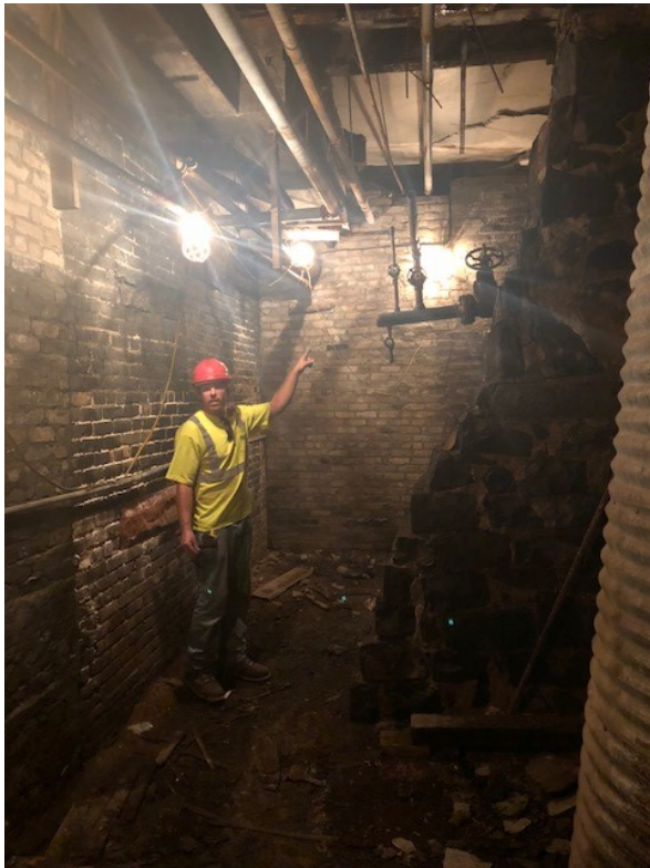
Northland staff member in the Northland Building vault.