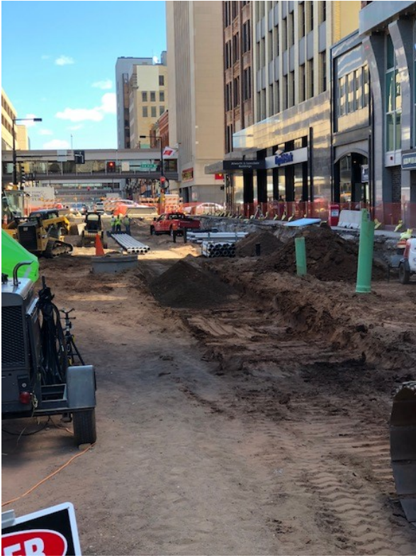
Preparing for electrical duct bank near 3rd Avenue W.