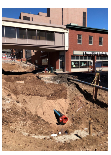
old water main excavated in front of Duluth Library