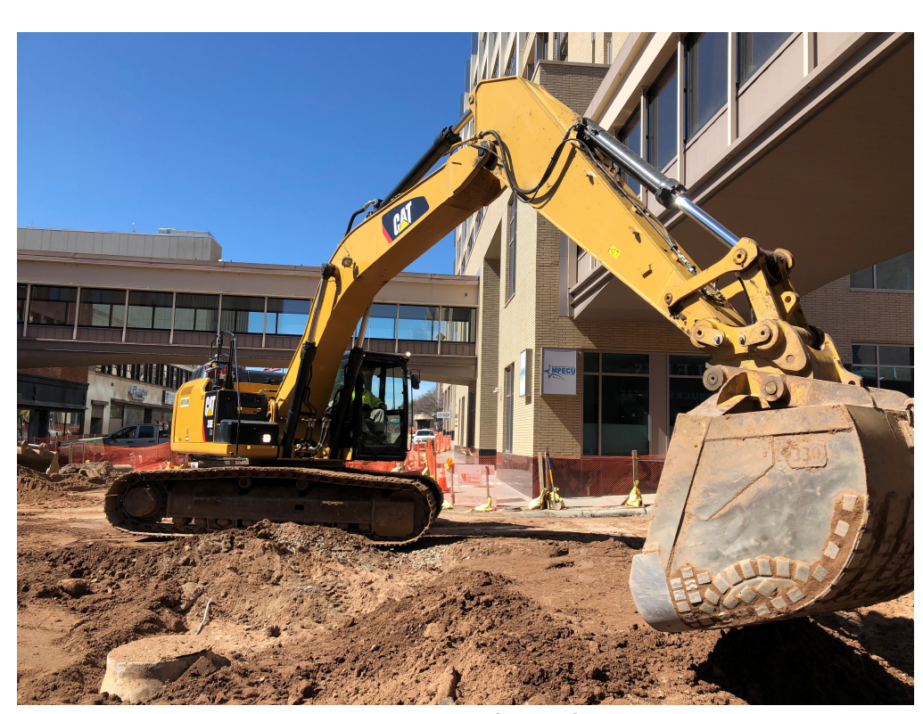
excavator moving earth