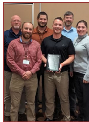
The Minnesota Sex Crimes Investigators Association awarded the Duluth Police Department the agency of the year award.