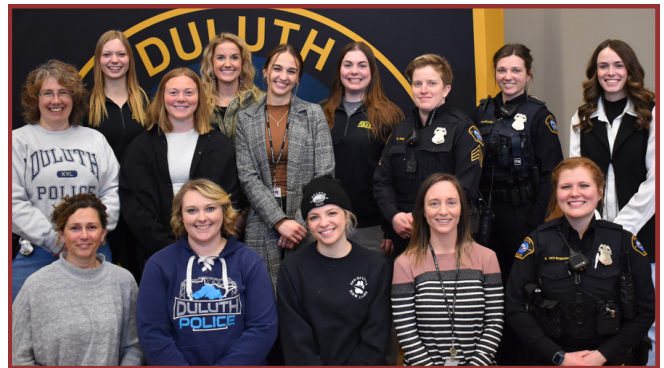
Women in Law Enforcement Open House.