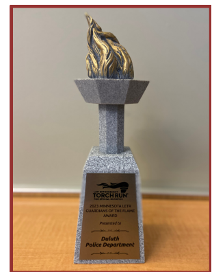
DPD was awarded the '2023 Guardian of the Flame' Award by Minnesota Special Olympics.