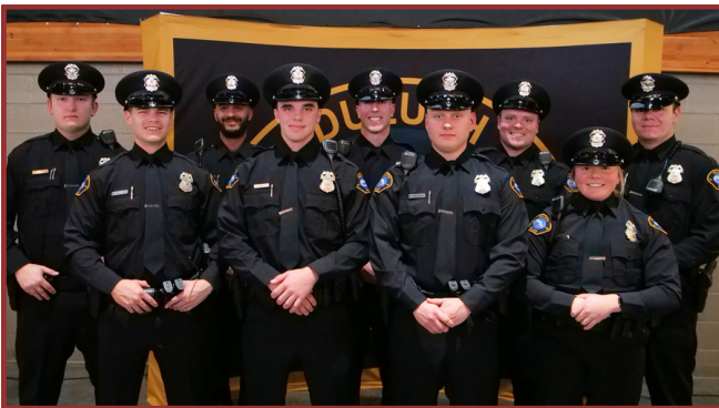
2023 Swearing-In Ceremony.

Connecting and building relationships with members of our community also bridge the gap in showcasing that we welcome applicants who have the passion to serve. We attended career fairs, along with stopping by our local High Schools during their career days, to start those conversations with interested students.