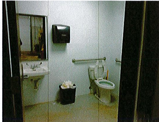
Photo 2: View of toilet room. Features of accessibility are provided. This is a good example of accessibility.