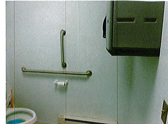
Photo 3: Remove the wall mounted storage cabinet from the toilet room that is currently within the clearance for the toilet.