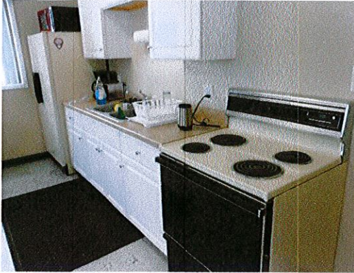
Photo 1: View of break room. The kitchen does not currently provide any features of accessibility.