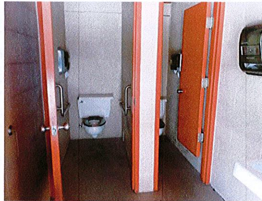
Photo 5: An ambulatory accessible stall has been provided, but not a 5' wide stall.