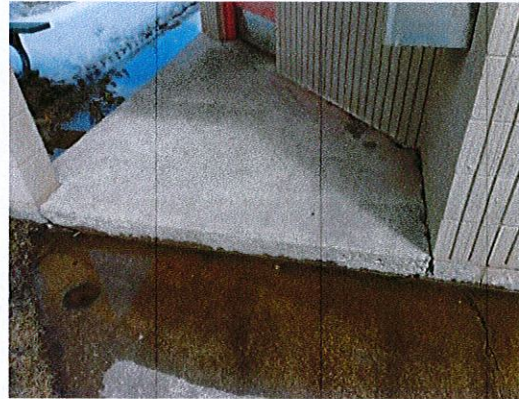
Photo 2: Eliminate the 4" rise at the concrete stoop to the men's toilet room.