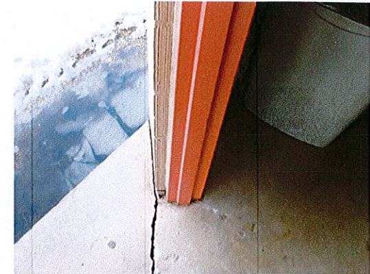
Photo 3: Enlarge the concrete landing to provide maneuvering clearance on the exterior side of the men's toilet room door.