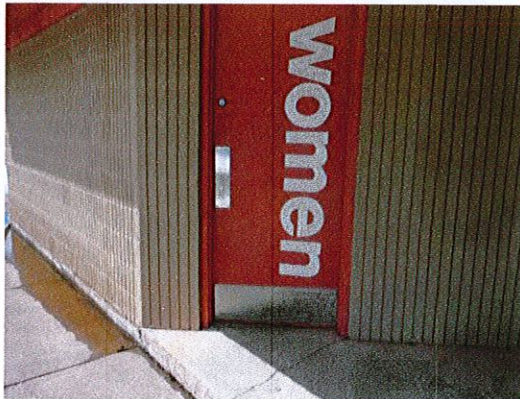
Photo 4: Eliminate the 4" rise at the concrete stoop to the women's toilet room and enlarge the concrete to provide maneuvering clearance on the exterior side of the door.