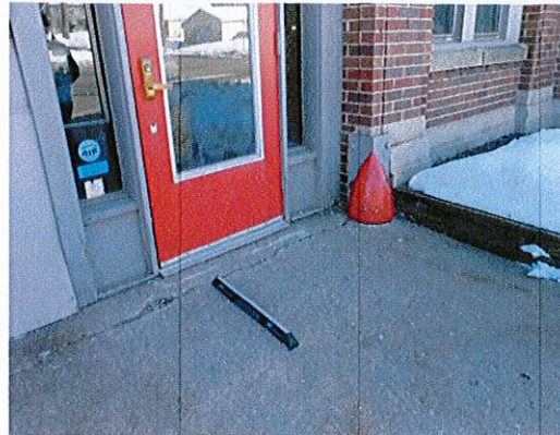
Photo 2: Modify to provide level (2% max) maneuvering space at the entry door.