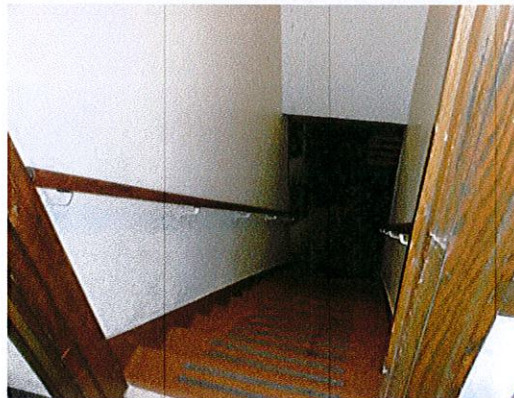
Photo 5: The route to the lower level. There is not currently an accessible route to the lower level.