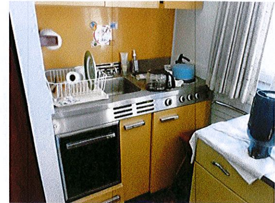
Photo 3: View of the kitchen. There are currently no features of accessibility provided.