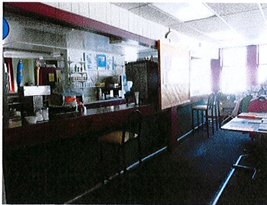
Photo 4: Lower a section of the counter to 36" maximum (currently at 43").