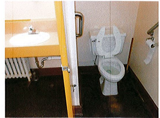
Photo 6: There is 1 toilet room designated as 'accessible'. Remodel to provide a compliant single user accessible toilet room.