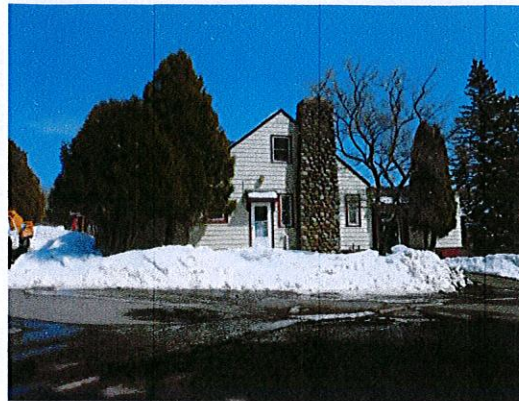
Photo 2: Post a sign at the main entry directing to the accessible side entry. (The main entry leads directly to stairs.)