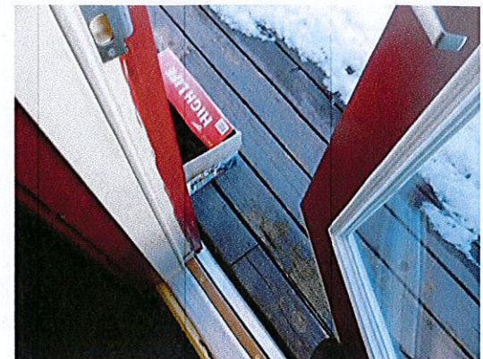
Photo 3: Modify the threshold to eliminate the 3" rise at the patio.