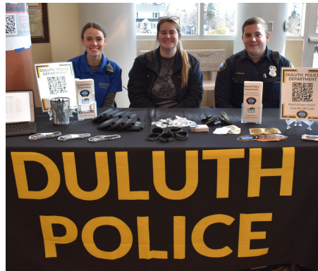
Members of DPD man a booth during a career fair event at a local high school.