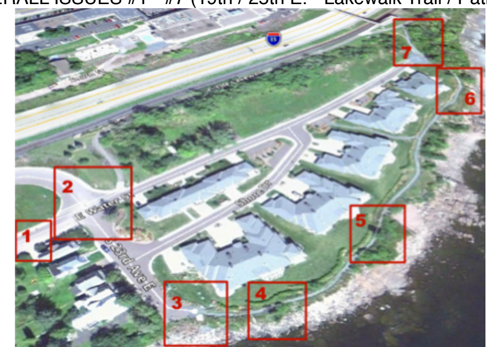
OVERALL ISSUES #1 - #7 (19th / 25th E. - Lakewalk Trail / Path