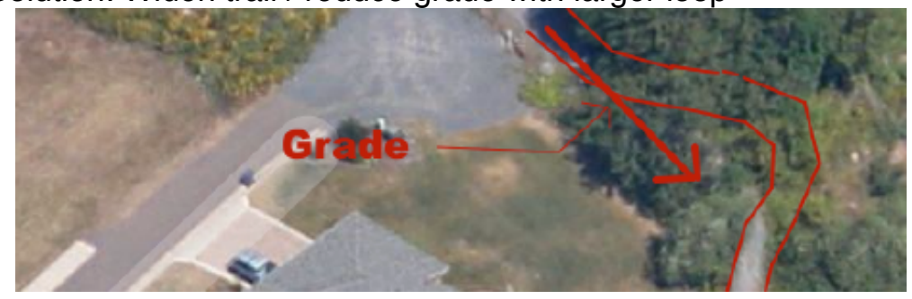
Issue #7 - Lakewalk - Path Grade (Obstructions and grade) Solution: Clear obstructions / cut grade in 1/2 with switchback

Issue #6 - Lakewalk - Path Grade (Width problem and grade) Solution: Widen trail / reduce grade with larger loop